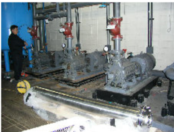
Water supply pump 10kg/m 2